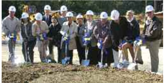
Groundbreaking for construction on campus.