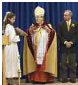
Dedication of the Harron Family Building with His Eminence Cardinal Justin Rigali.