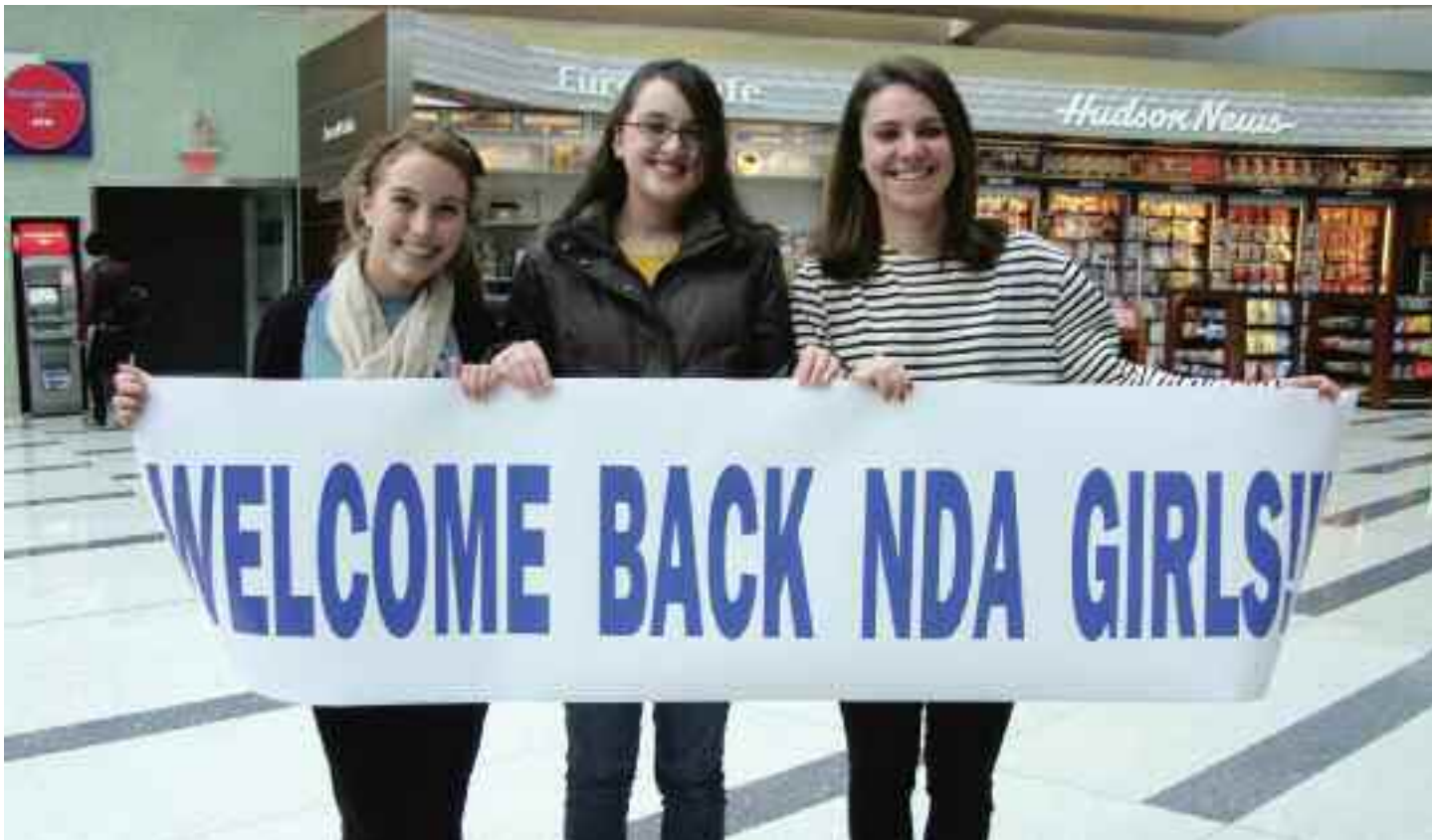
A warm welcome at the airport for Notre Dame's world travelers.